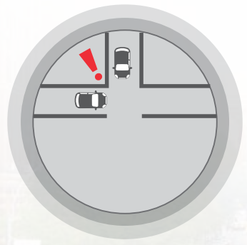
Intersection Collision Avoidance