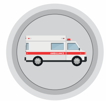
Approaching Emergency Vehicle