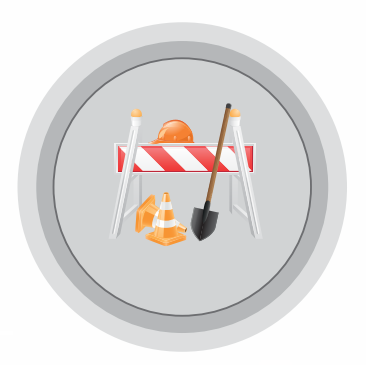
Road Work Zone

Below is a selection of the applications that will be deployed and tested: