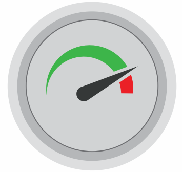
In-vehicle speed limits