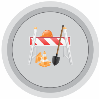
Road Work Warning

Below is a selection of the applications that have been shortlisted to be implemented and deployed in the pilot: