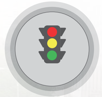
Green Light Optimal Speed Advisory