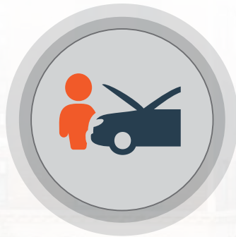
Broken down vehicle