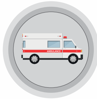
Approaching Emergency Vehicle